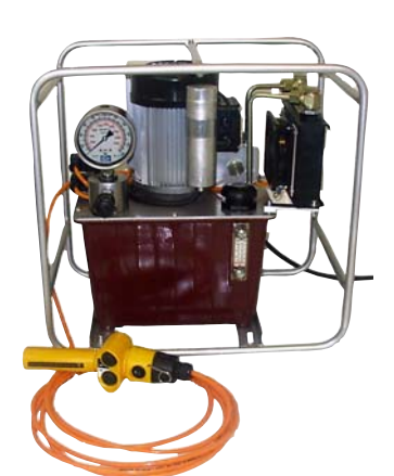
Shown with Heat Exchanger