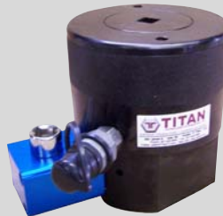
High Load Single Piston & Double Stacked Tensioners for 10.9 proof load requirement ASTM A490M and EN ISO 898 1:1999