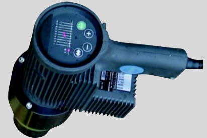
Titan ETite Electric Torque Wrenches Plus Series Torque & Angle