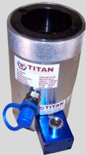
Foundation Bolt Tensioners

are an integral element for getting your bolting job done right, on time, every time