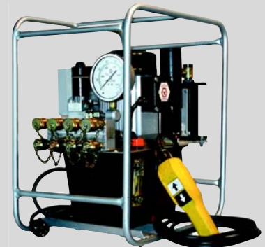
Titan Hydraulic Torque Wrench Pumps including the revolutionary SmartTite Autocycle Torque Wrench System

TITAN is a leading bolting solutions provider committed to offering the most reliable and comprehensive bolting solutions world wide.