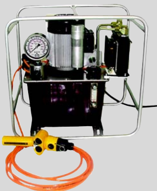
EXE 2000TT Electric Tensioner Pumps