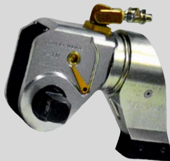
Titan Hydraulic Torque Wrenches